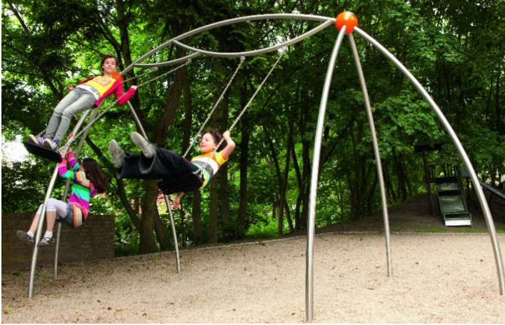
Swingo.2.4 The large two-bay-version of the Swingo combines asymmetry and high-flying-dynamics. Cool game – cool look!